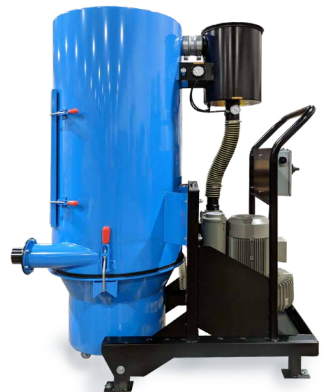
The DuroVac DVR makes an ideal compact central vacuum system.

And like all our portables, the DVR easily upgrades to HEPA certification.