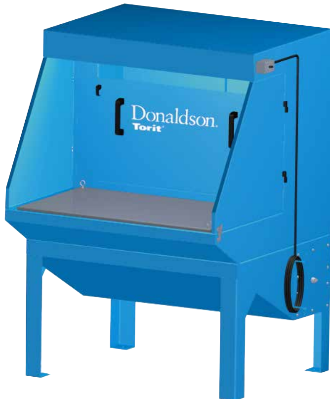
RWB - 2000

Designed for weld fume applications, the remote workstation integrates easily with other Donaldson® Torit® air filtration products.