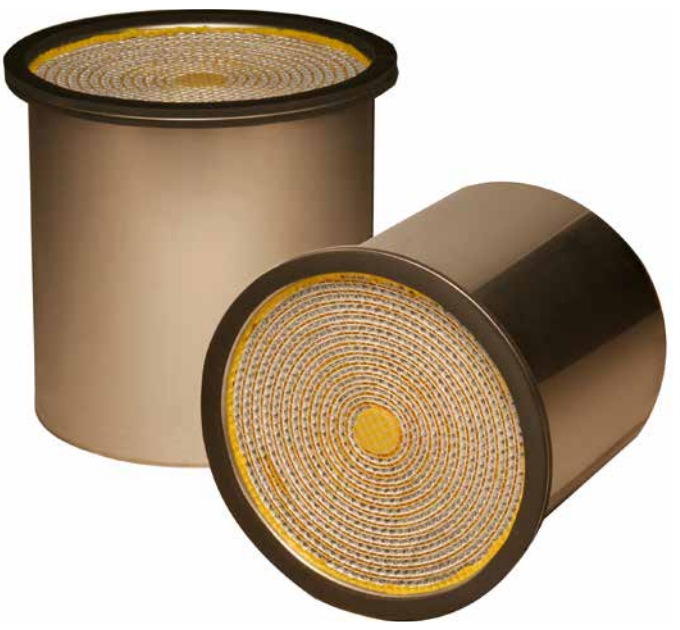
Ultra™ Cylindrical HEPA Filters