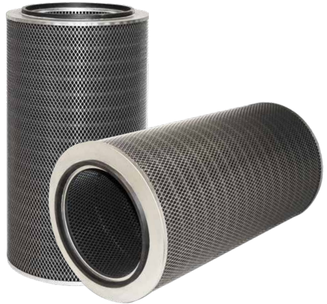
Ultra-Web Conductive FR Cartridge