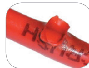
The Firetrace Detection Tubing is the "heart" of the system

Another benefit of the Firetrace system is its ability to effectively suppress deep seated hazards, which are common to dust collection systems. Deep-seated hazards are subject to smoldering fire conditions, and are best extinguished by a three-dimensional extinguishing agent. Firetrace typically recommends the use of Carbon Dioxide (CO 2 ) as the extinguishing agent.* CO 2 is a highly effective, listed and approved three-dimensional fire extinguishing agent that can be easily scaled to fit virtually any size dust collector system. CO 2 will quickly penetrate all parts of the collector to effectively suppress a deep-seated fire in seconds. And every second saved results in less damage and, ultimately, less downtime.